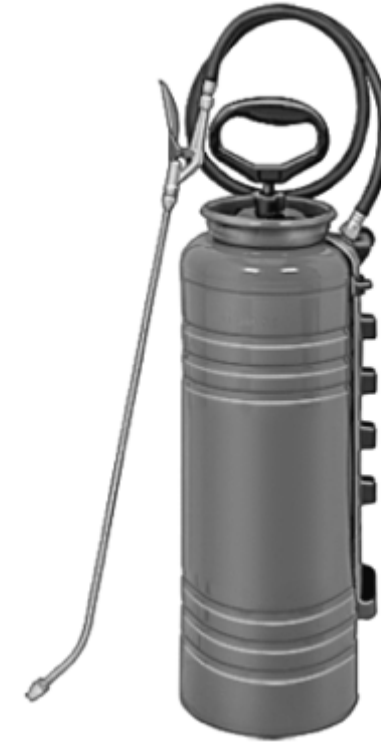
3 & 5-GALLON MANUAL PUMP-UP SPAYERS