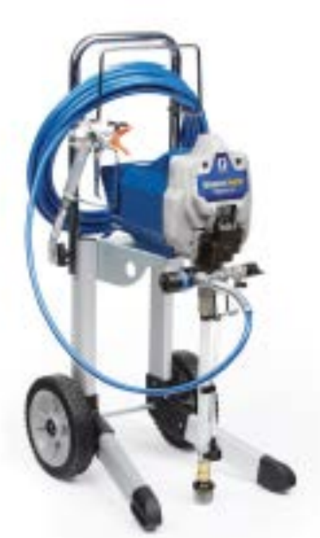
AIRLESS POWERED SPRAYER