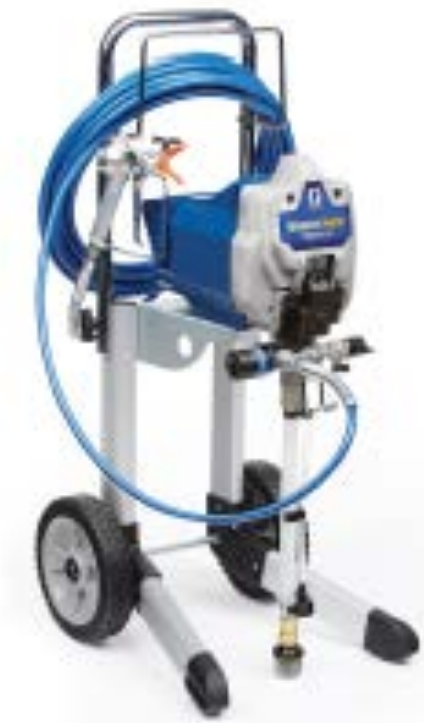
AIRLESS POWERED SPRAYER