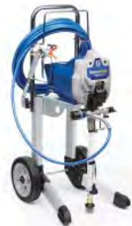
AIRLESS POWERED SPRAYER