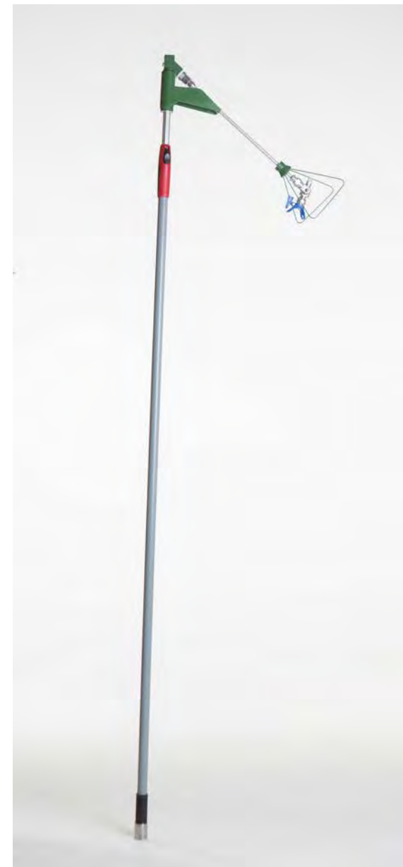
SEMI-AUTOMATED TRUCK SPRAY SYSTEM